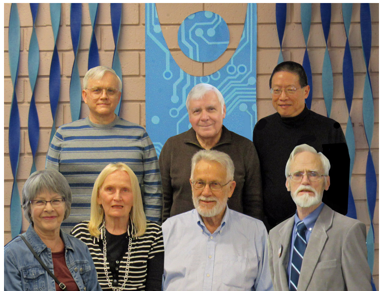
Board of Humanist Community in Silicon Valley 2017