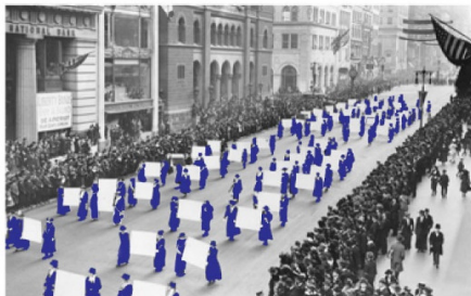
Every Day will be Women's Equality Day When We Pass the E.R.A.!