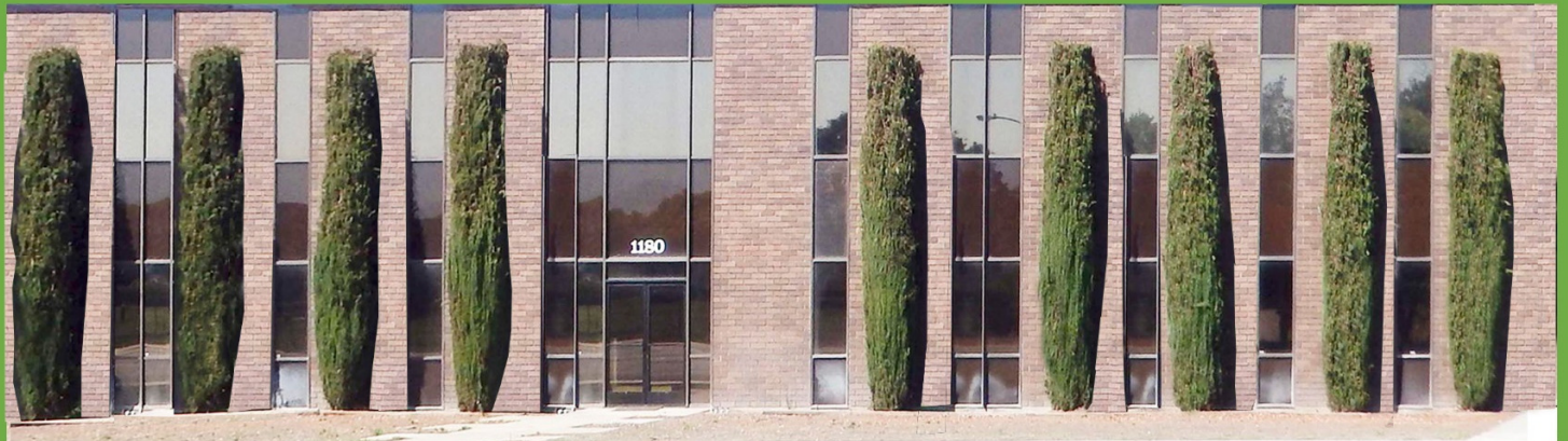
OUR NEW HOME - 1180 COLEMAN AVE - SAN JOSE