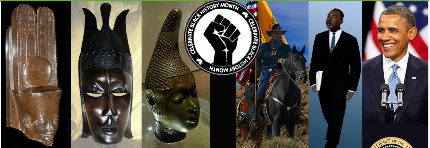
Pharaoh Tertamani of 26th Dynasty 761-656 BC